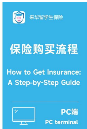
Step. 1 登录留学保险网 Login to lxbx.net